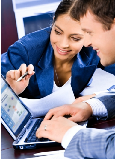
The Premier Cost Estimating & Project Management Solution