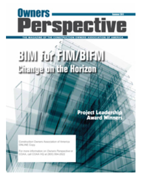
Click to Download Full Article

The success of these processes and technology tools is totally dependent upon transformational changes regarding the ways in which AEC professionals deliver their products and services.