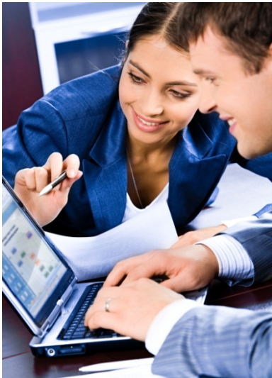
The Premier Cost Estimating & Project Management Solution