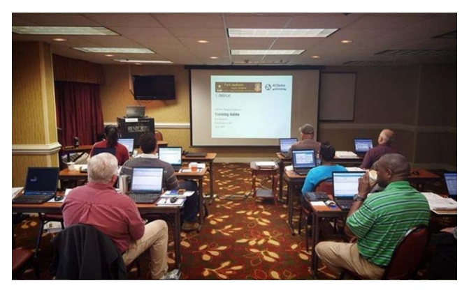
Ft Jackson, SC Training